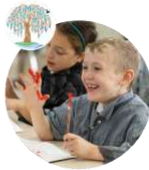
Emmbrook Junior School