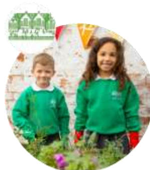
Wescott Infant School