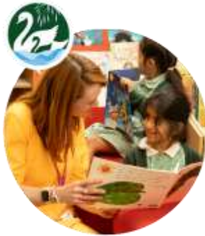
Emmbrook Infant School