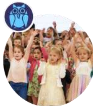
Owismoor Primary School