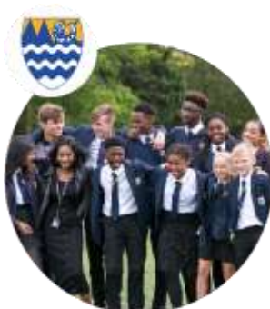
The Emmbrook School