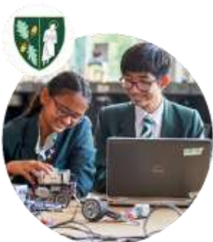
St Crispin's School