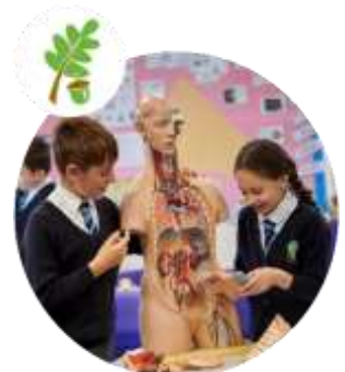
Westende Junior School