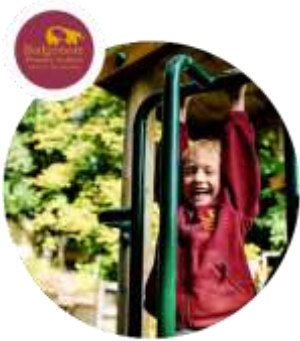
Badgemore Primary School

As a trust we are rooted in this approach and our ambition is clear; to improve the educational outcomes for children and young people. We don't want to change schools; we want to help them progress.