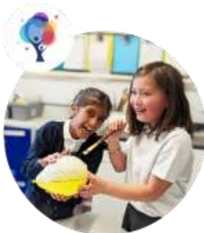
Nine Mile Ride Primary School