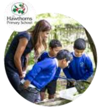
The Hawthorns Primary School