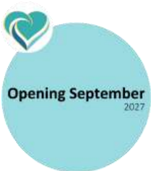
Hartland Primary School