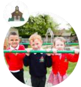
Shinfield Infant and Nursery School