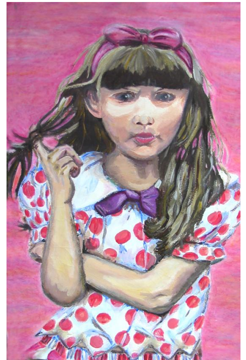
By Natalie Mahon (year 9)

We provide an art trip for gifted and talented students at key stage 3 every year with a range of interesting activities relevant to the galleries or locations we visit. Often year 12 students lead groups and set challenging tasks.