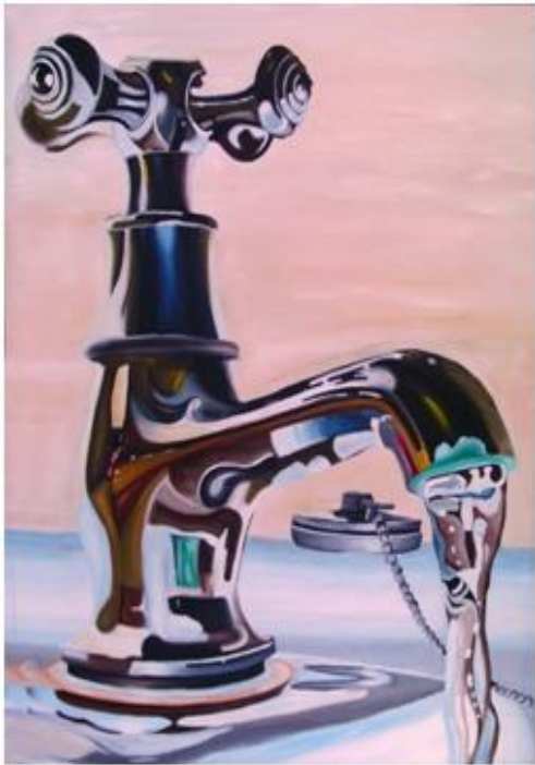
By Katie English (year 13)

A-level art work from St Crispin's is exhibited in local exhibitions and office spaces every year. Students get the opportunity to lead younger students in art workshops and enter national competitions.