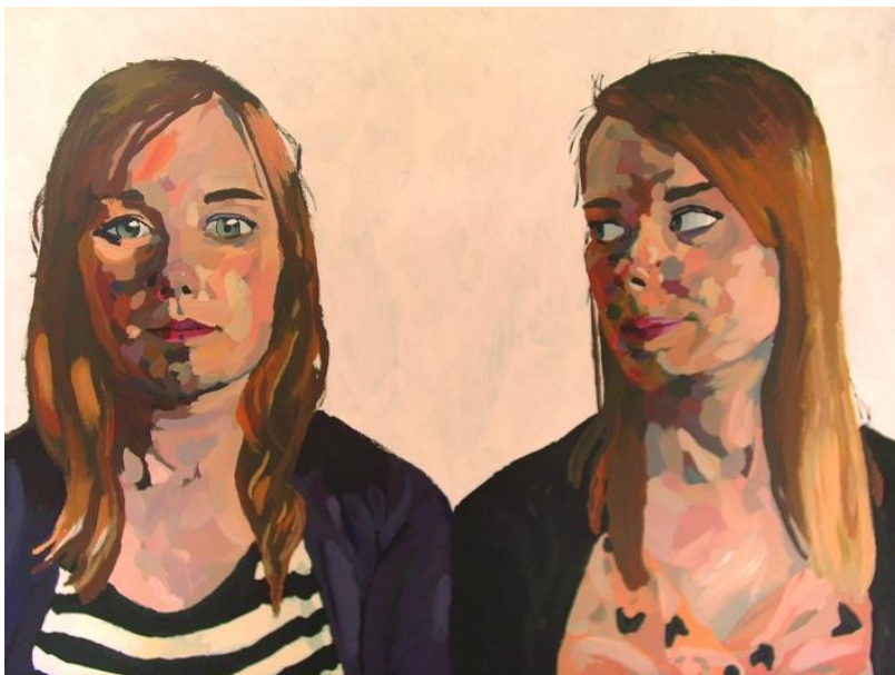
By Fern Brereton (year 11 exam)

Gifted and talented year 10 and 11 GCSE students are expected to push the boundaries when it comes to experimenting with different media and their ideas. Higher level skills and techniques are demonstrated to groups and individuals depending on the route their personal projects lead them. It is expected that students with a greater aptitude in art use artist research fluently to inform their ideas and that they can confidently share and communicate their views. Higher level GCSE coursework shows an exciting and diverse range of ideas clearly informed by the wide ranging research the students undertake.